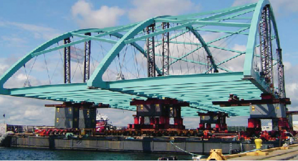
Assembled in staging area & barged to site on SPMTs Providence River Bridge, Rhode Island, 2006