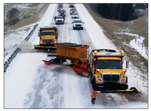
The clearing width of a TowPlow is evident in the above photo.

The TowPlow is a steerable trailer-mounted plow that is pulled behind a tandem axle snowplow truck and is able to swing out to one side, which doubles the plow width of a tandem-axle snowplow truck. The TowPlow is equipped with a 26-foot moldboard and either a granular spreader or a tank for dispensing liquids