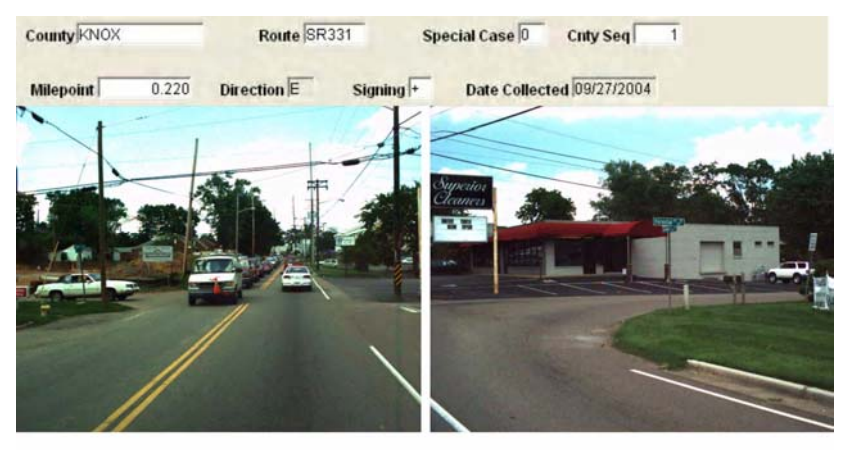
Photo 3. TRIMS image looking northbound at the Forestal Dr intersection at L.M. 0.23 (right) and the Coile Rd intersection at L.M. 0.24 (left).