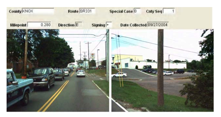
Photo 4. TRIMS image looking northbound at the McCamey Rd intersection at L.M. 0.29 (right).