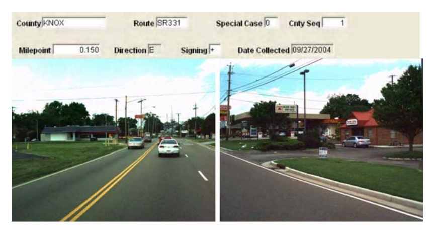
Photo 2. TRIMS image looking northbound at the Baum Rd intersection at L.M. 0.18 (right).