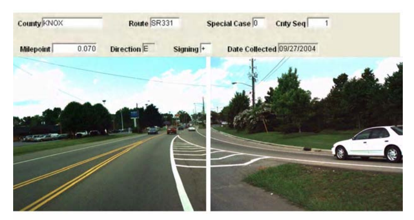
Photo 1. TRIMS image looking northbound where the Ramp from SR-33/Broadway enters at L.M. 0.11.