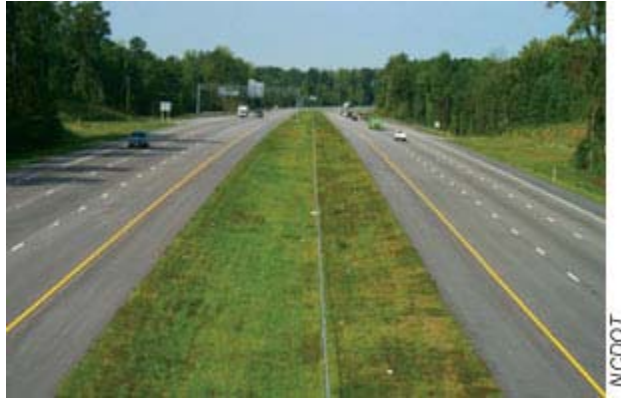
Another cable guardrail installation on Interstate 540 in Wake County, NC, showing an extremely narrow median.

North Carolina freeways began in 1999 and was completed in 2004.