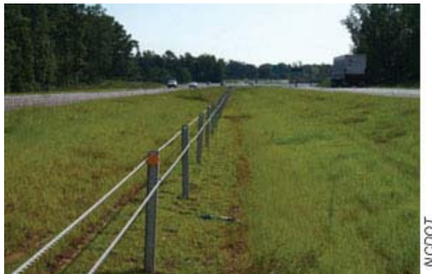
The North Carolina Department of Transportation installed this cable guardrail along Interstate 540 in Wake County, NC.

The 1993 study used available crash history to identify 24 interstate locations totaling 148 kilometers (92 miles) that had an unusually high number of cross-median incidents. The researchers recommended prioritized safety improvements, primarily placement of median barriers, at these locations. These safety improvements were either constructed at the time or programmed into the NCDOT Transportation Improvement Program (TIP).