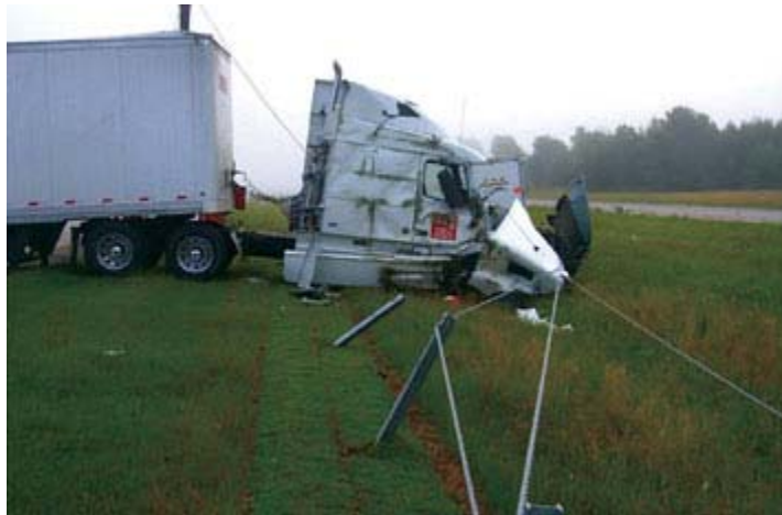
The cable median barrier stopped this semitrailer truck, preventing a potentially deadly cross-median crash.

North Carolina saved lives by installing cable barriers on freeways where the median width is less than 21 meters (70 feet).