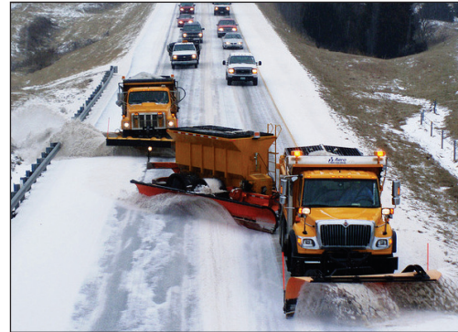
The clearing width of a TowPlow is evident in the above photo.

The TowPlow is a steerable trailer-mounted plow that is pulled behind a tandem axle snowplow truck and is able to swing out to one side, which doubles the plow width of a tandem-axle snowplow truck. The TowPlow is equipped with a 26-foot moldboard and either a granular spreader or a tank for dispensing liquids for snow and ice control. The TowPlow has been used successfully in Missouri since 2005.