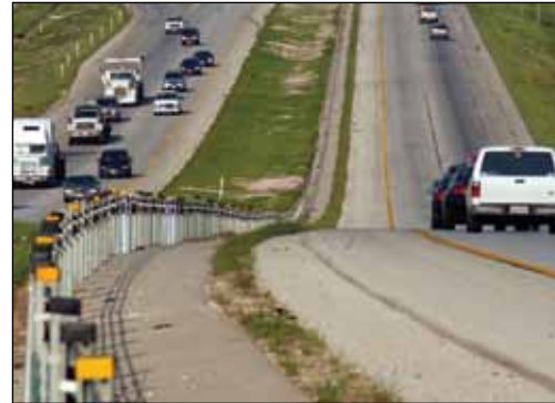
This CMB installed along IH 20 in Texas had an immediate impact in reducing the number of fatalities from cross median collisions.

Best Practice Information: An initial team goal was to accumulate “best practice” guidelines from the several states already using CMB, from CMB producers, and from researchers. The most helpful and detailed information was provided by lead states team members themselves, based on their own state experiences.