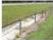
U.S. Generic Low Tension Barrier

CMB systems are available from several vendors, including: