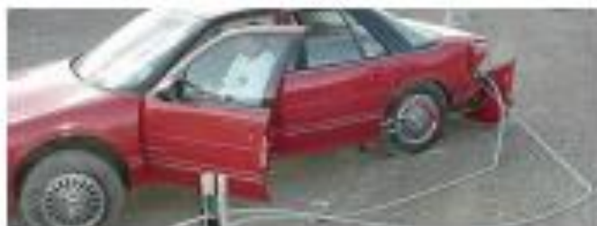
Fatal Crashes from Cross Median Collisions

Cable median barriers work as a retrofit on existing, reconstructed, or new medians that are wide and relatively flat. They are also effective on sloped terrain. They generally cost less to install than other barrier systems. Repair and maintenance costs are easily offset by their life saving and injury-reducing benefits.