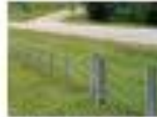
Thirty Cable Safety Systems (CASS)