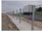
Gibraltar Cable Barrier