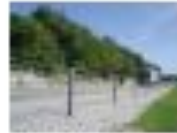
Griffin Safety Fence