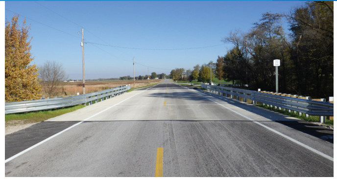
▶ Completed bridge with a view of the finished deck.