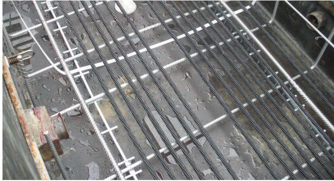
▶ Prestressed concrete box beam casting bed with the CFCC strand and the bottom stainless steel U-rebars used for shear reinforcement installed in place. Note the rectangular block out at the lower left side of the photo of the exterior beam used to run the tie rods through beams during the beam installation operation.