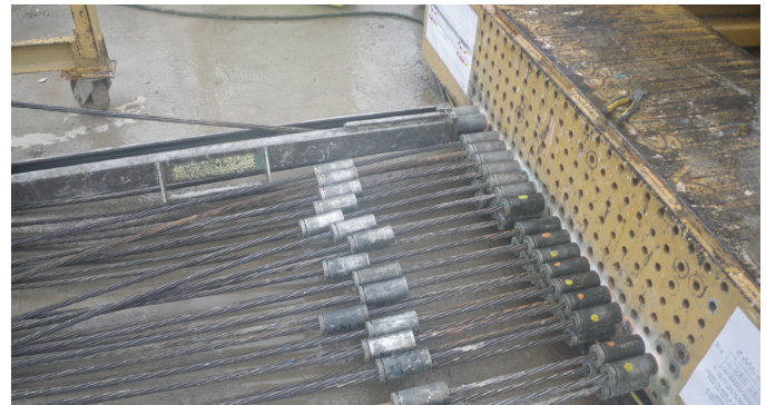
▶ Prestressed concrete box beam casting bed with the bulkhead and prestressing chucks set in place color coded for the stressing operation sequences. Note the stressing jack will fit between two chucks to normally function.