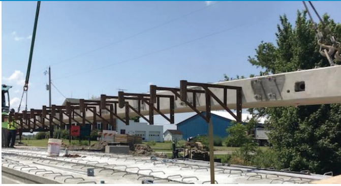
▶ An exterior box beam being launched to set onto the beam seat.