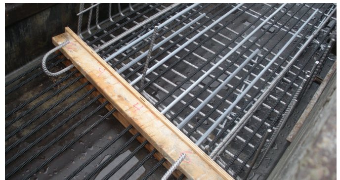
▶ Looking at beam end of the prestressed concrete box beam casting bed with the CFCC strand and the bottom stainless steel U-rebars used for shear/confinement reinforcement installed in place.