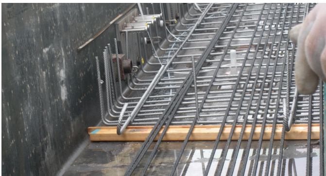
▶ Prestressed concrete box beam casting bed with the CFCC strands being set in place.