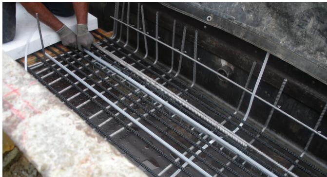
▶ Prestressed concrete box beam casting bed with the CFCC strand and the bottom stainless steel U-rebars used for shear reinforcement installed in place. Note the bond breaking plastic sleeve being installed.