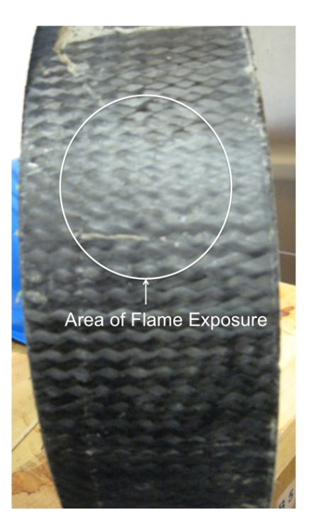
Figure 3. Area Exposed to Flame