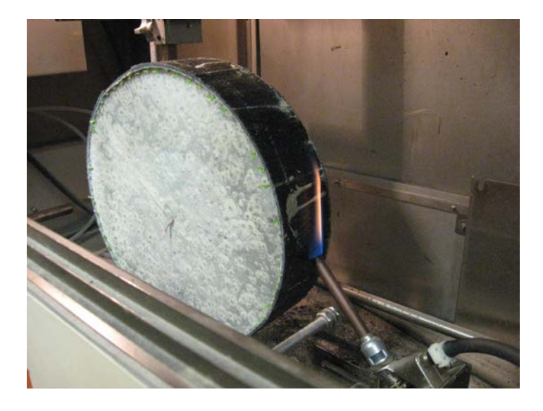
Figure 2. Ignition Test Setup