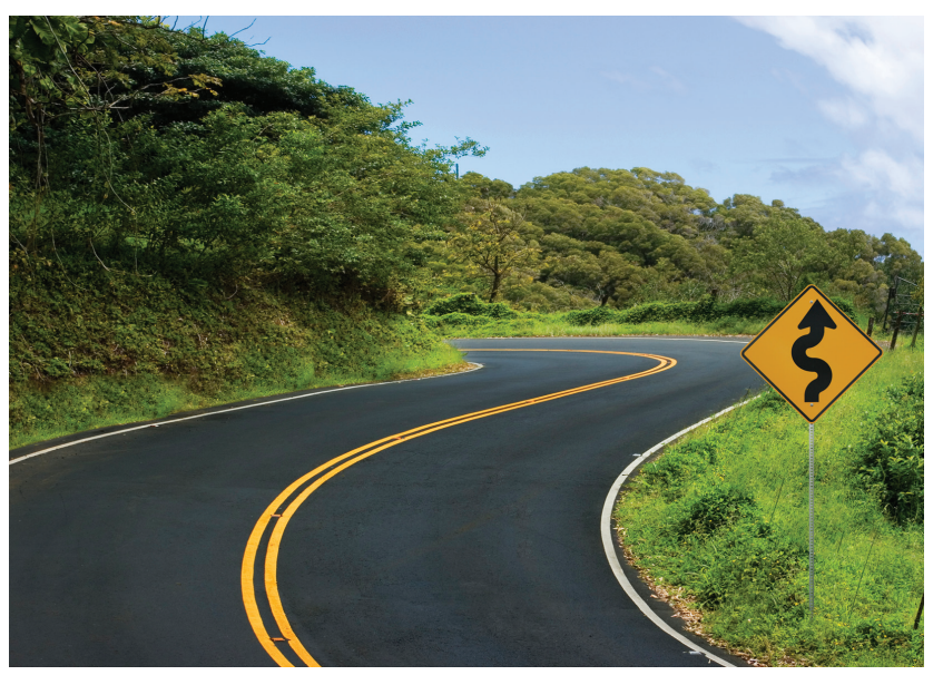
CEA enables a user to quickly and easily derive the radius and classification of a curve along a given segment of road.

The result of the research was CEA, a software tool compatible with Windows<sup>®</sup> 7 and ArcGIS 10, which quickly provides accurate roadway curvature data for HPMS reports. It enables a user to quickly and easily derive the radius and classification of a curve along a given segment of road.