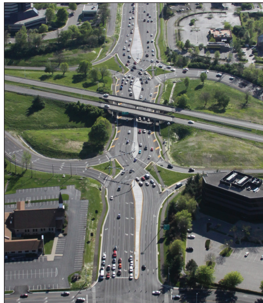
Kentucky's first DCD — the US 68/KY 4 interchange in Lexington, Ky.

The existing roadway consisted of two through lanes in each direction and single left turn lanes at the New Circle Road Interchange. The project was physically constrained by the existing right-of-way and by the New Circle Road bridge piers. The conventional solution of adding an additional through lane did not address the high crash rate in the area or the capacity issues for left-turning vehicles to the entrance ramps, and in fact would make weave issues even worse. The concept also meant reducing shoulders considerably in order to fit the widened template between the bridge piers. It was clear another solution was needed.