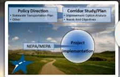
MDT Corridor Studies