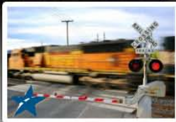
Montana Public At-Grade Railroad Crossings