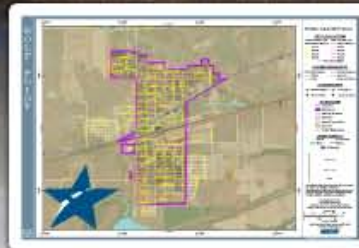
MDT Fuel Tax Routes