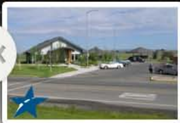
Montana Rest Areas - Travinfo