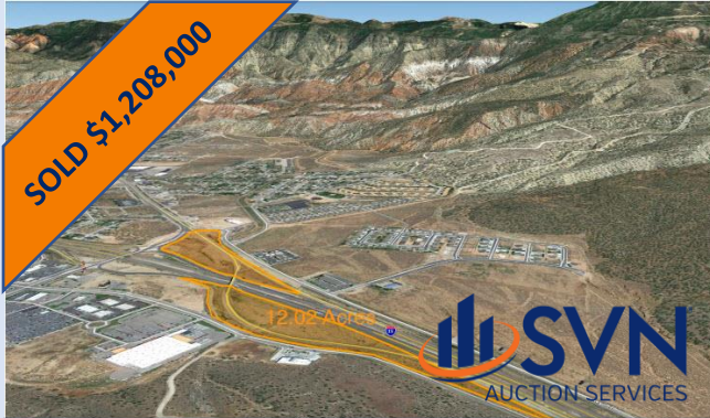
1800 S PROVIDENCE CENTER DR., CEDAR CITY, UT