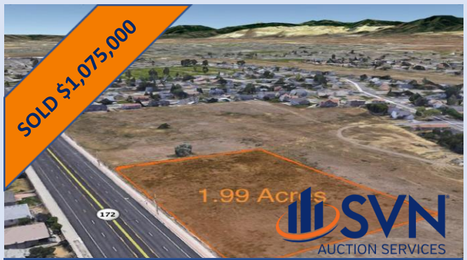
5540 S 5600 W WEST VALLEY CITY, UT