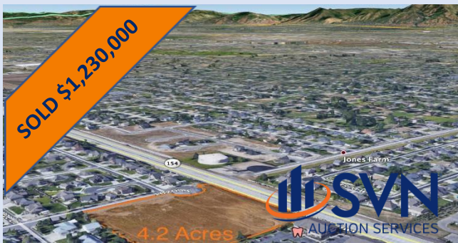
3667 W 10200 S & BANGERTER, SOUTH JORDAN, UT