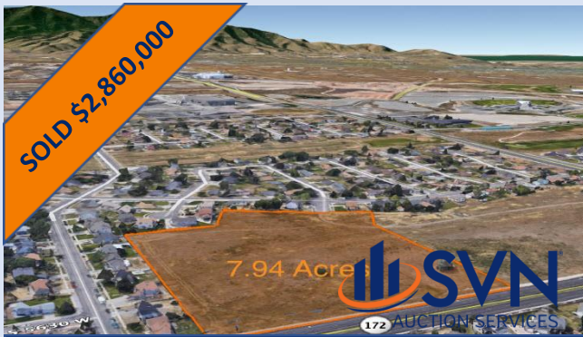
5622 S 5600 W, KEARNS, UT