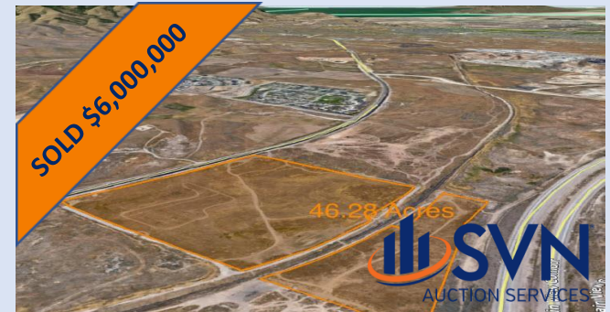
6851 S OFF U 111, SALT LAKE COUNTY, UT