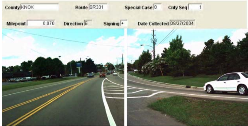
Photo 1. TRIMS image looking northbound where the Ramp from SR-33/Broadway enters at L.M. 0.11.