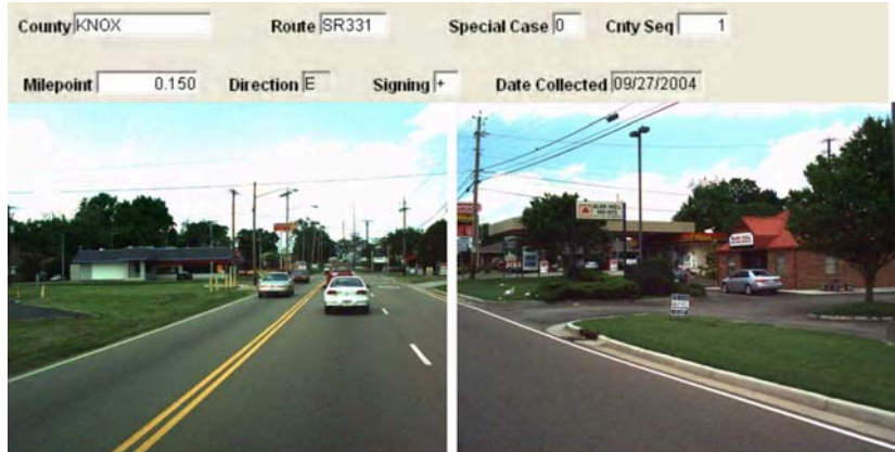
Photo 2. TRIMS image looking northbound at the Baum Rd intersection at L.M. 0.18 (right).