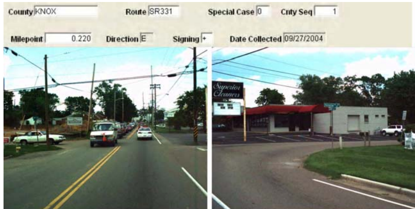
Photo 3. TRIMS image looking northbound at the Forestal Dr intersection at L.M. 0.23 (right) and the Coile Rd intersection at L.M. 0.24 (left).