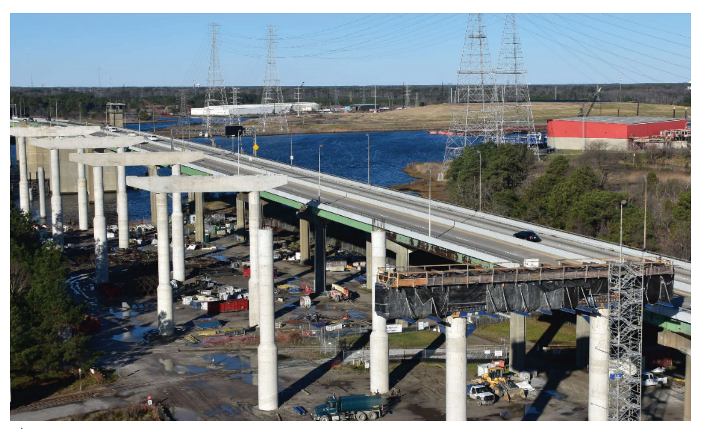
This photograph shows construction underway on High Rise Bridge.