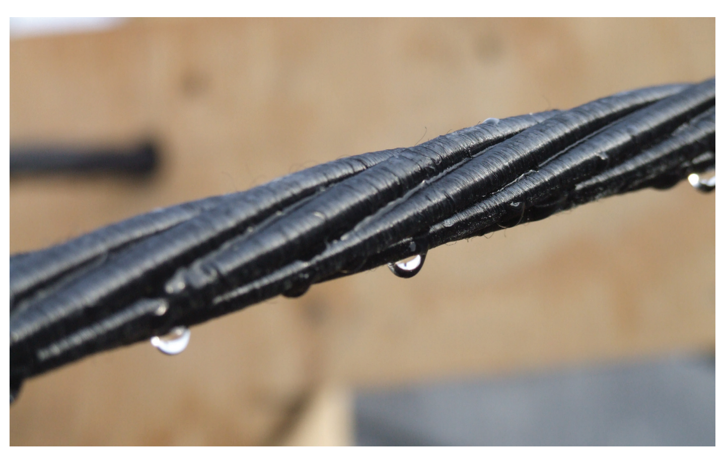
If the CFRP design is selected, the CFRP reinforced beams or piles will be corrosion free. This photograph shows a close-up images of the CFRP strand that was taken at a fabricator's facility in the morning after a rain storm as they made beams as part of an earlier VDOT project.