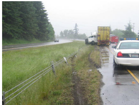
A cable median barrier restrains a semi truck on I-5 at mile post 252.

The next report will also contain a comparison of two types of cable median barriers, low tension and high tension, and also a discussion of how WSDOT maintains the cable median barriers.